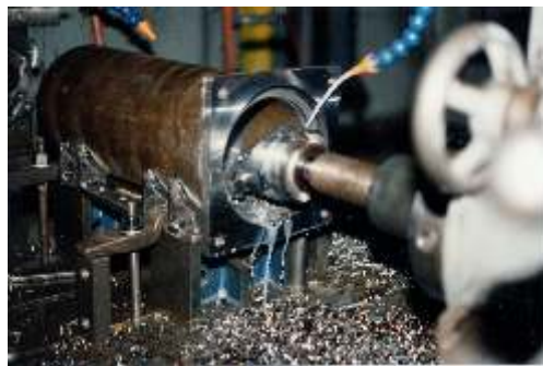
Precision Milling on a Hydraulic Ram.