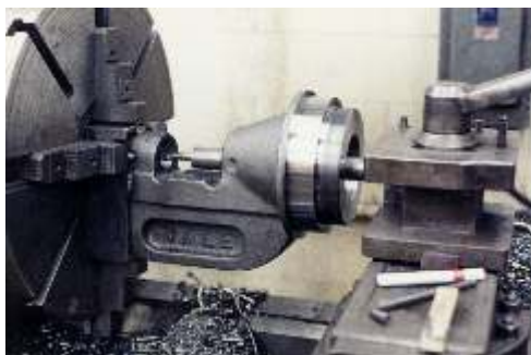
A 10,000 psi Hydraulic Bar Shear is being turned on a lathe.