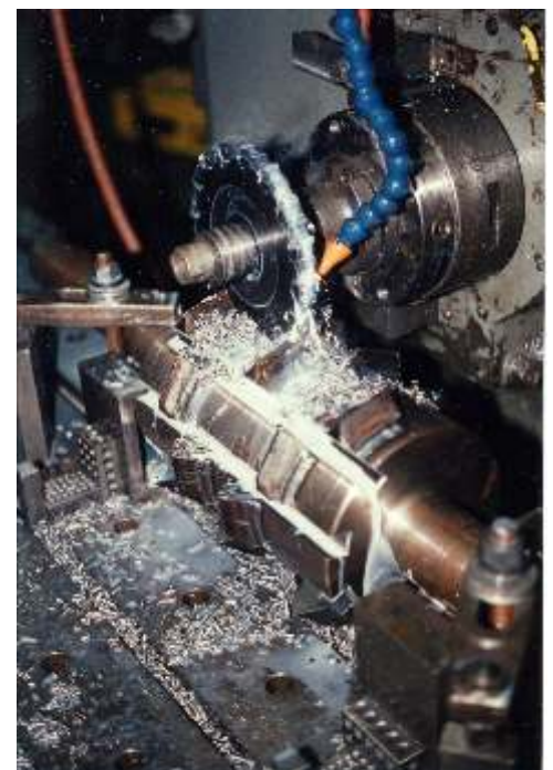
Milling cutter seats on a grinder head.

INDUSTRIAL WOOD PRODUCTS, LLC P. O. Box 22 Clermont, IA 52135 Telephone: 563-423-1800 Fax: 563-423-1801 www.IndustrialBiomass.com email: IWP@IndustrialBiomass.com