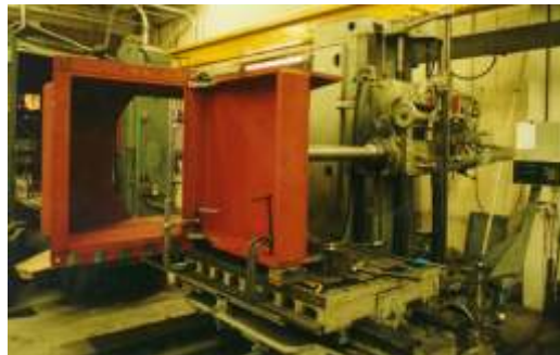
Milling on a bin unloader weldment.