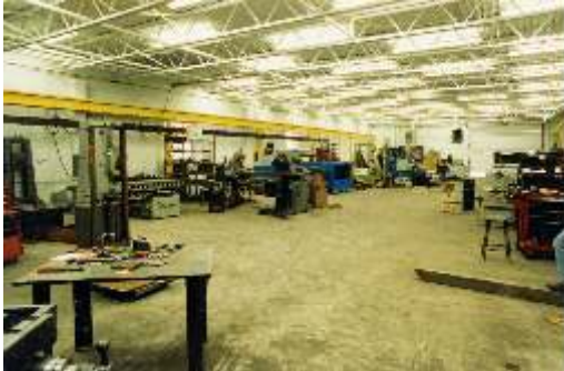
Layout of the Machine shop at Industrial Wood Products, LLC.